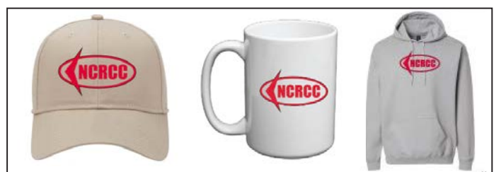
NCRCC swag available on the website