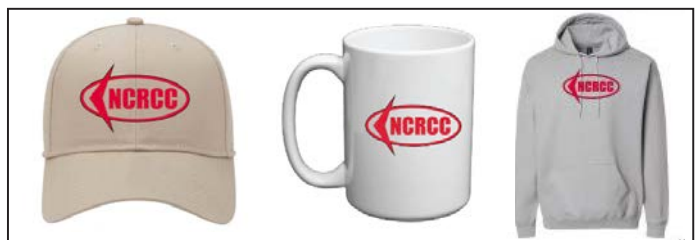
NCRCC swag available on the website

Safety rules were read aloud. Communicate intentions on the flight line, work together for safety. As has been the long standing rule planes are not allowed under the large pavilion, however this topic is under discussion. We will review club rules and report back on this topic at a later meeting. The smaller pavilion may be used to assemble models under. Asking for ideas, Rob Hebert questioned if the wood parking lot guard rail should be treated? This was treated with a spray 2 years ago and will be inspected. ←