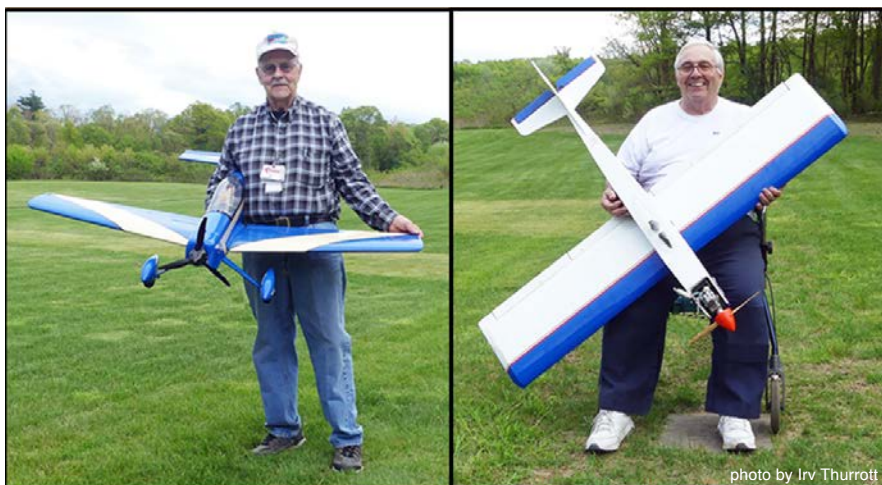
A few entries from our 2025 contest.