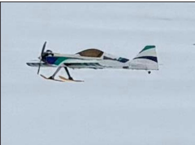
Ola's fun fly plane did great in the high winds