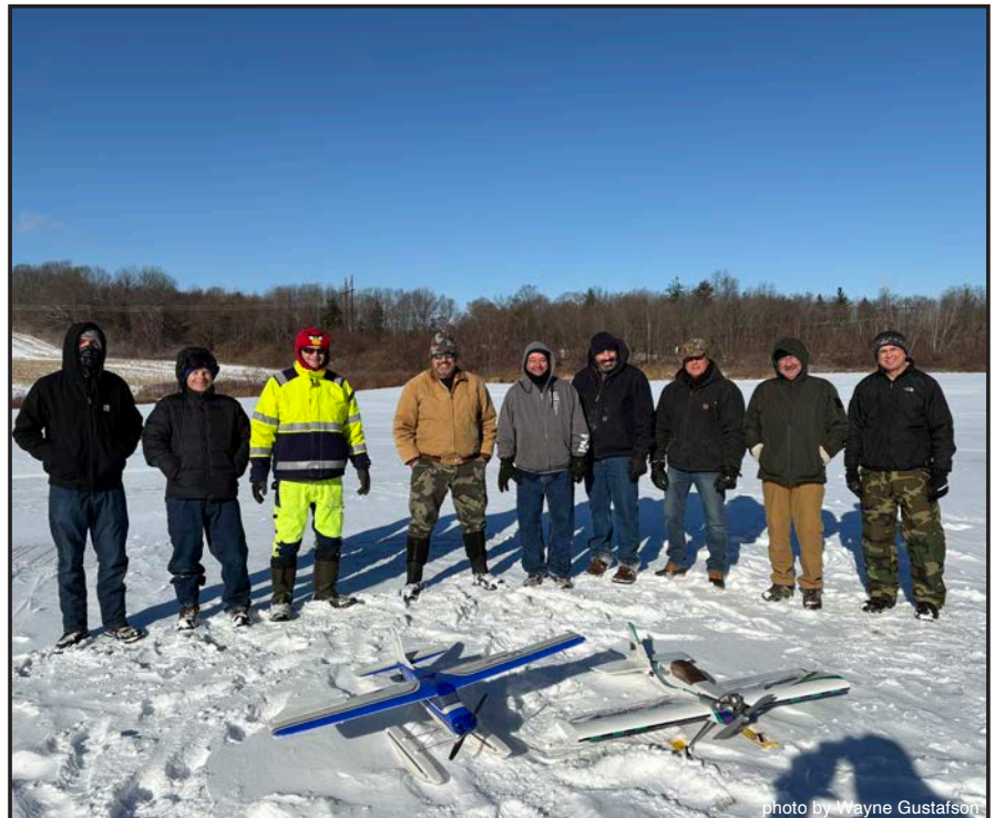
NCRCC members bundled up for the Frozen Finger Fun Fly (see pages 6 and 7 more more photos)

Please send any newsletter contributions to waynegustafson@gmail.com