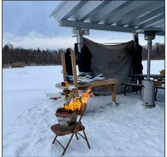
Ola provided the much needed warming station