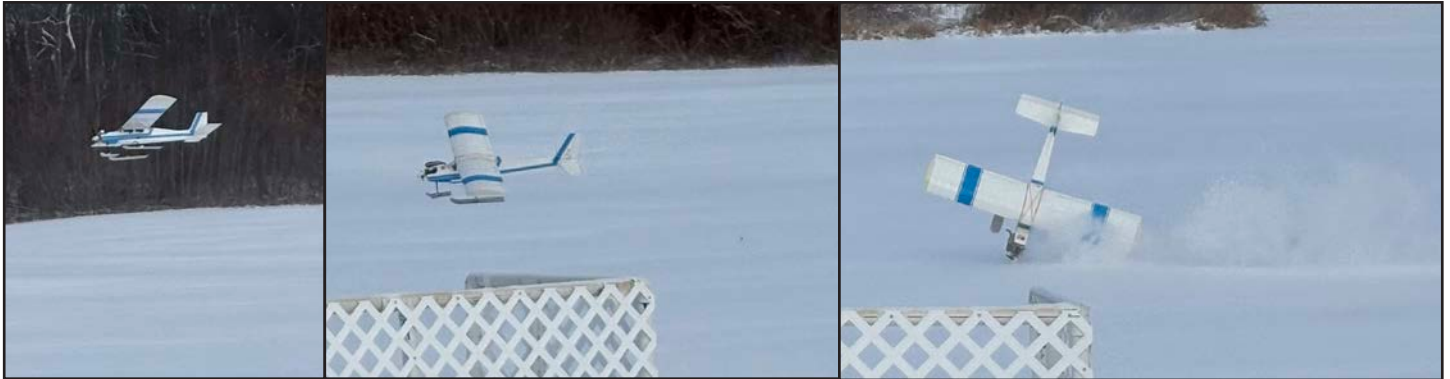
Bill's approach looked great until a big gust at touchdown. The fluffy snow kept damage to a minimum and made for a great action shot.