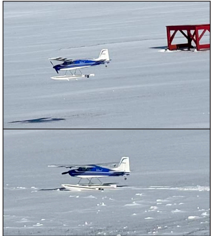
Kevin's float plane handled the wind with ease