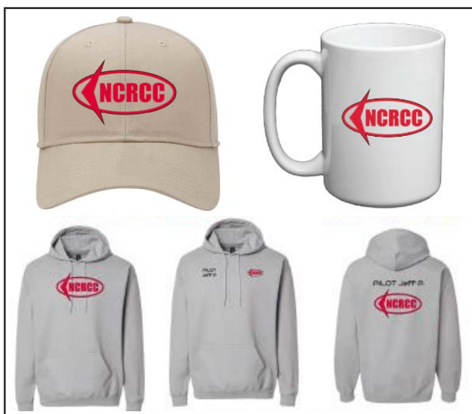
NCRCC swag available on the website