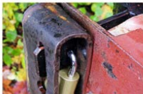
Properly locked 1) Gate Closed 2) U-cover on Tang 3) Lock is locked, Combination scrambled