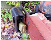
Unlocking and Locking 1) Pull lock outside U-cover 2) Set (or scramble) the Combination 3) Push Lock up at angle 4) Pull down on lock 5) Twist lock to remove or insert