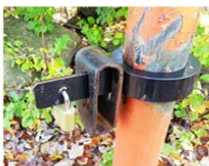
While Flying 1) Swinging Gate is open 2) Gate components are as pictured