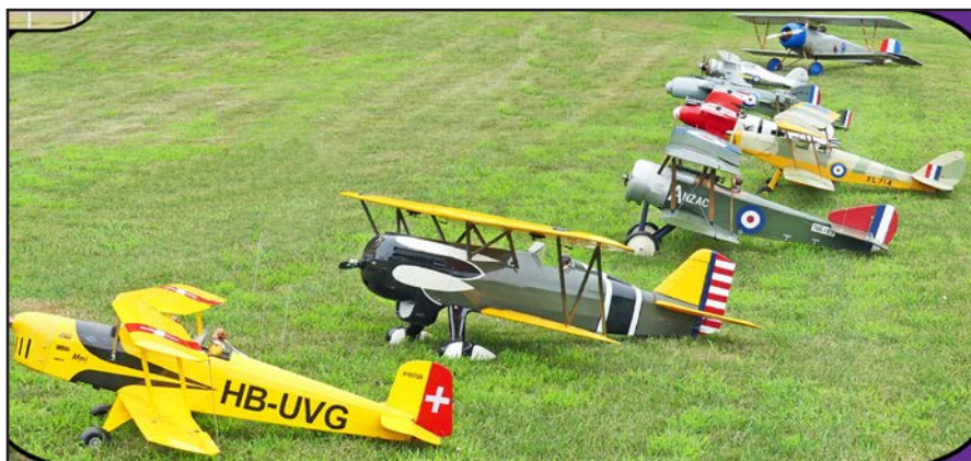
The Dawn Patrol Lineup