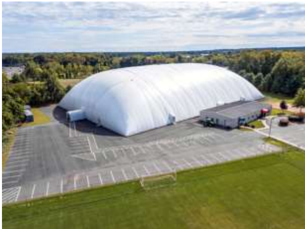
East Windsor Dome (Sports World)

Starting Friday, November 11, 2022 at 1:00pm indoor flight activities will resume at the East Windsor dome (Sports World) for the 2022-2023 season. Please see Bob Spooner, Art Usher, or Irv Thurrott for greater detail. Our facility is located at: