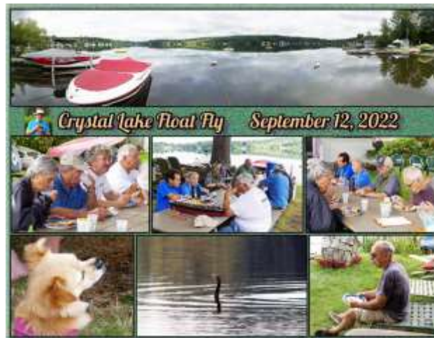
"Crystal Lake Float Fly"