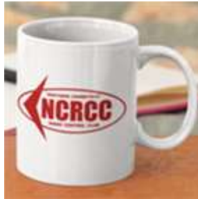
2022 NCRCC Club Merchandise