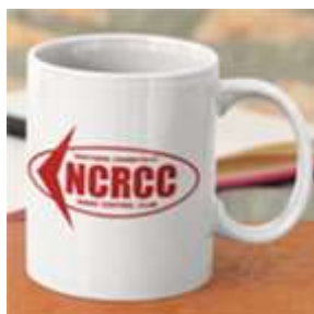
2022 NCRCC Club Merchandise