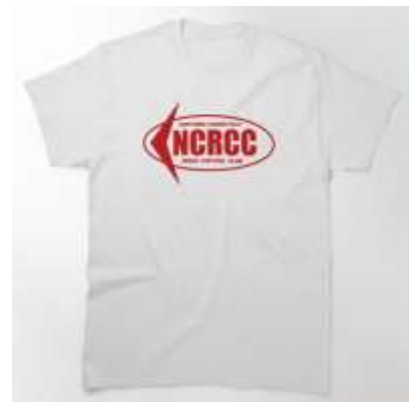
Tee Shirts !