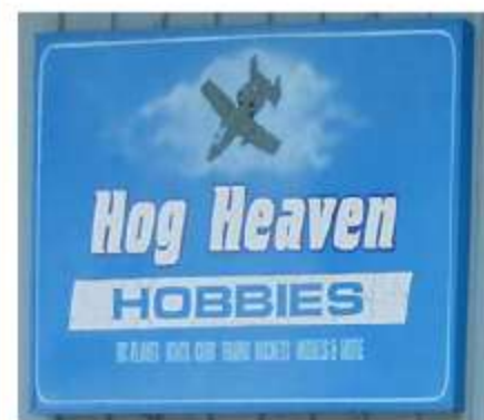
29 th Anniversary Sale March 11 – 19 2022

Lately it seems like every time I write for the club newsletter there's fresh snow on the ground.