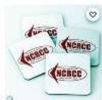
Coasters/ and Lol