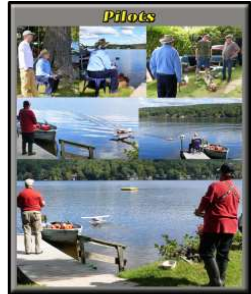
Float Flying Fun