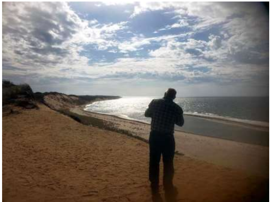
Cape Cod National Seashore (U.S. National Park Service)