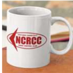
2021 NCRCC Club Merchandise