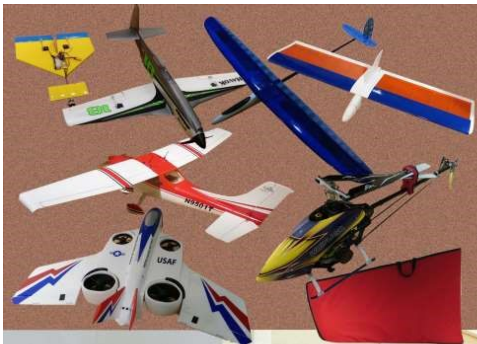
Pilot Projects November 2019 No two the same.

Goofus does their very best to close our gate without instruction. Gallant if uncertain asks or checks the instructions on our website. http://www.ncrcc.org/index.php/openclose-gate