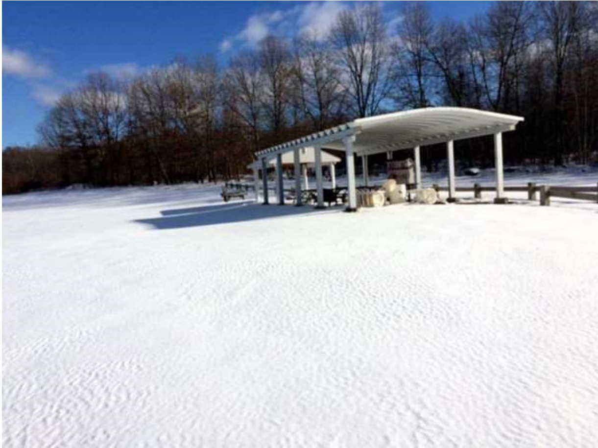
NCRCC Field December 8, 2019