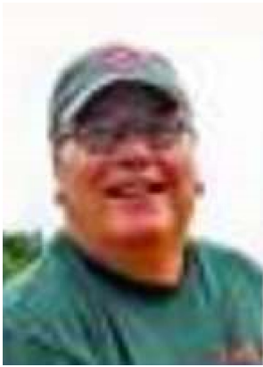
NCRCC Public Liaison Officer-Elect