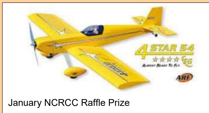
January NCRCC Raffle Prize